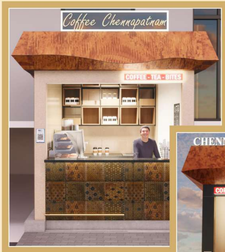
IMAGE GALLERY OF OUR CAFES